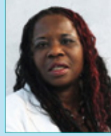
Jacinta Nwachukwu Appointed Governor