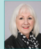
Lynne Lynch Public Governor