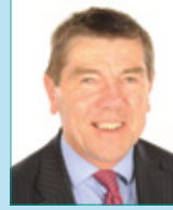
Eddie Pope Appointed Governor