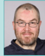
Sean Barnes Public Governor