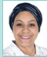
Takhsin Akhtar Public Governor