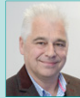
Peter Askew Public Governor