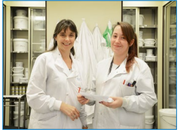
Pathology team members