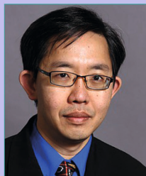
Chooi Oh Staff Governor