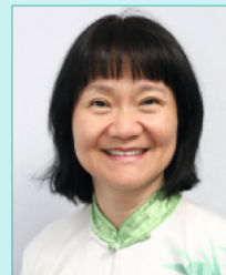
Feixia Yu Public Governor