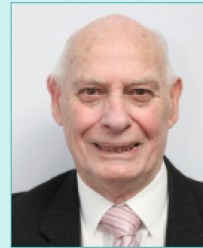
David Blanchflower Public Governor