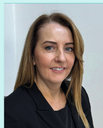
Angela Kos Public Governor