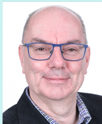
Graham Robinson Public Governor