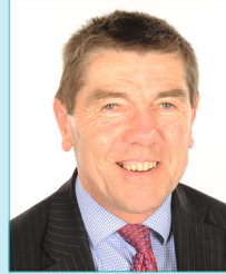
Eddie Pope Appointed Governor