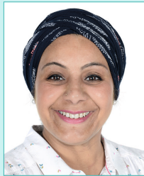
Takhin Akhtar Public Governor