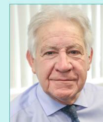
Phil Curwen Public Governor